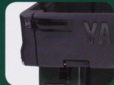
You'll appreciate the low loading height of our bed and the rattle free positive locking tailgate.