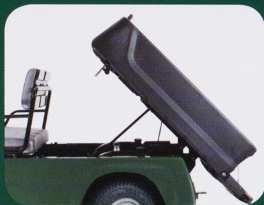
The utility dump bed comes with a folding tailgate, prop rod and hydraulic shock. Power dump optional.