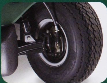
Self adjusting drum brakes on all 4 wheels allow you to stop and work anywhere.