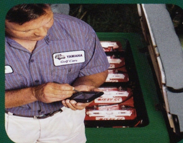
The PDA based Yamaha Genius system allows us to customize your U-MAX to fit your particular needs.