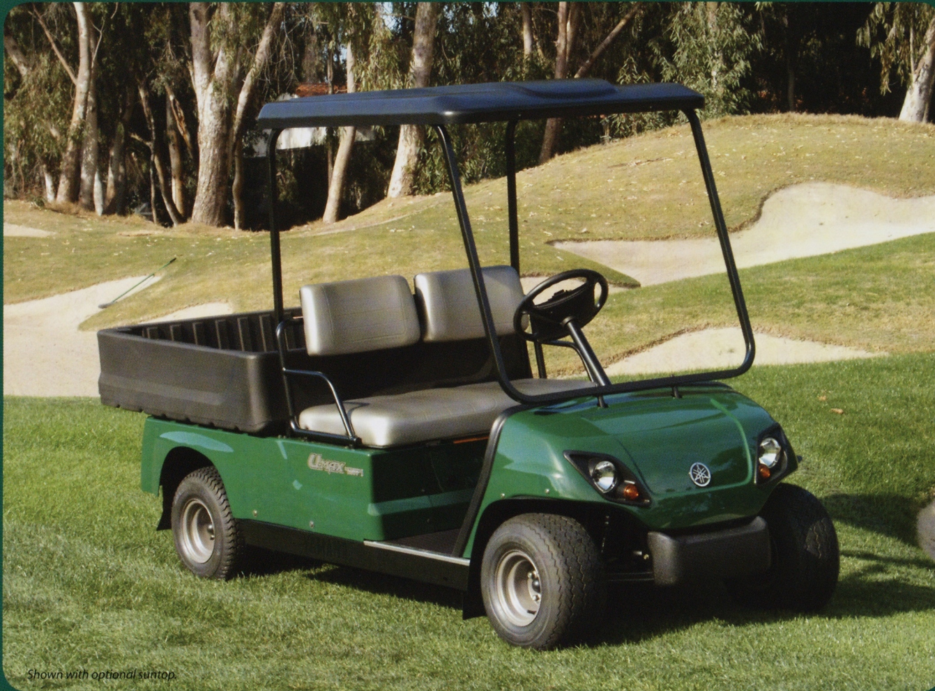
Shown with optional suntop.

Not only does the Yamaha U-MAX Medium Duty I Utility Vehicle carry a large payload, it also carries quite a reputation. The latest in a long line of precision engineered utility vehicles from Yamaha, the U-MAX sets the standard for others to follow.