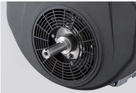
▼ Front P.T.O.